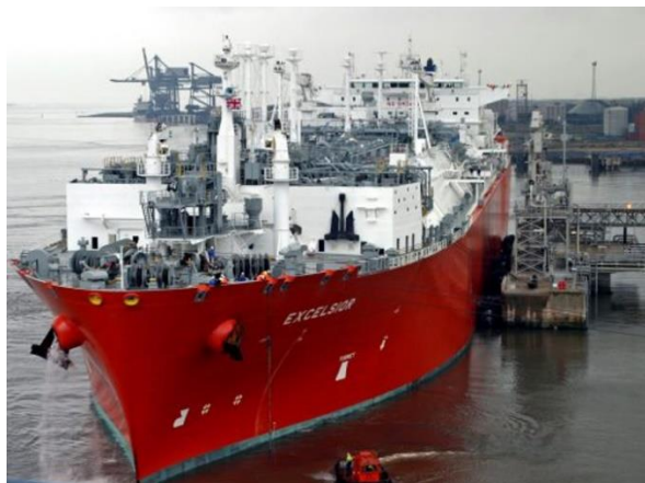
FSRU Excelsior

Deutsche Energy Terminal (DET), Germany's state-owned operator of four terminals, is moving forward with its second liquefied natural gas (LNG) terminal in Wilhelmshaven. To this end, Norway's technology company EConnect Energy has been hired to install a jettyless ready IQuay solution for LNG import to Wilhelmshaven. Thanks to this, the Norwegian player has tapped France's marine contractor GEOCEAN for subsea installation work.